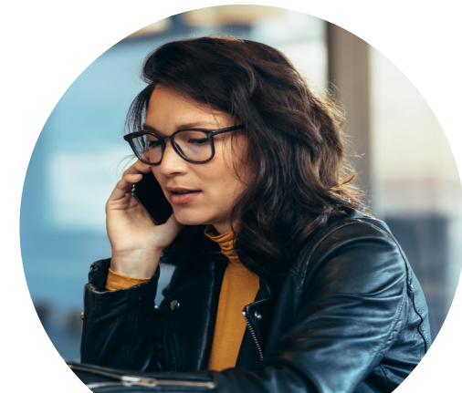
BUSINESS & COMMUNICATIONS