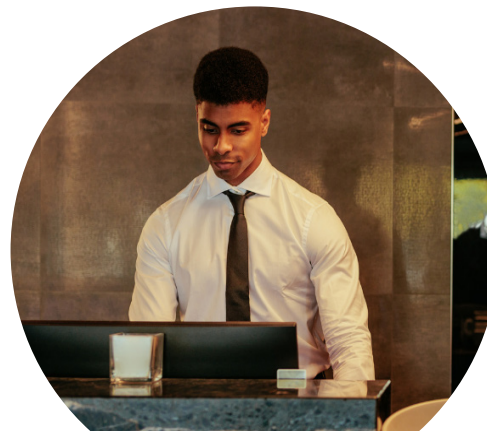
BUSINESS & HOSPITALITY