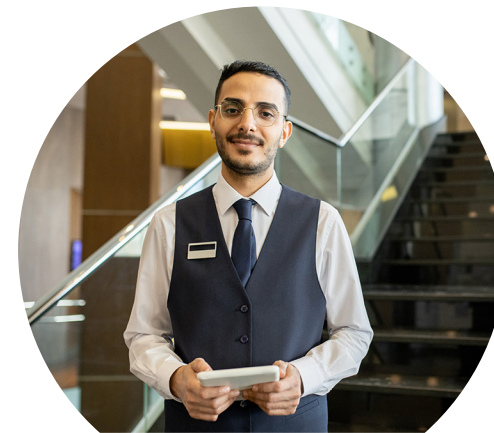
BUSINESS & HOSPITALITY

Acsenda School of Management Bachelor of Business Administration